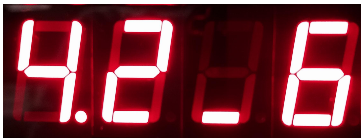
Fig 3. Example of default settings on start-up.