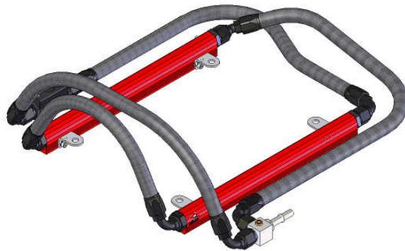
Example of “returnless” fuel system plumbing