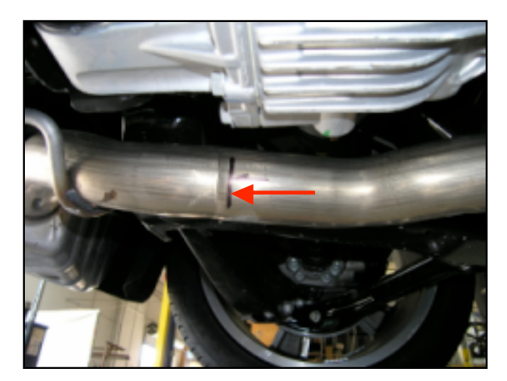
Driver side pipe cutting location