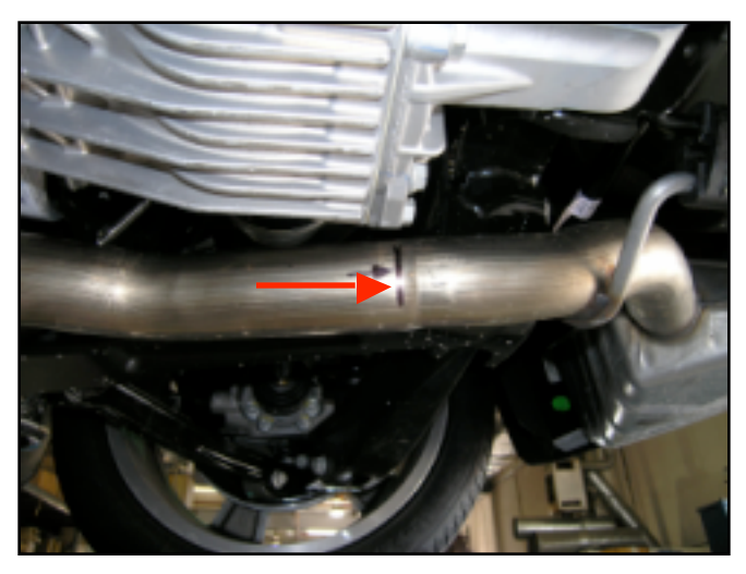
Passenger side pipe cutting location